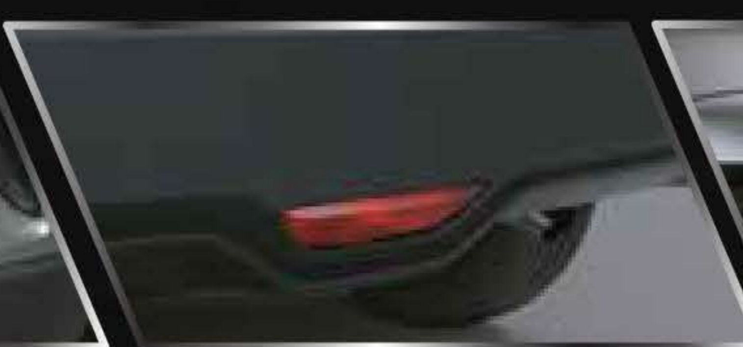
REAR FOG LAMP