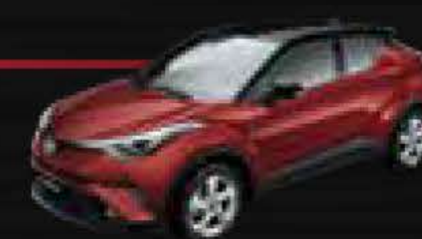
Red Mica with Sporty Black Roof