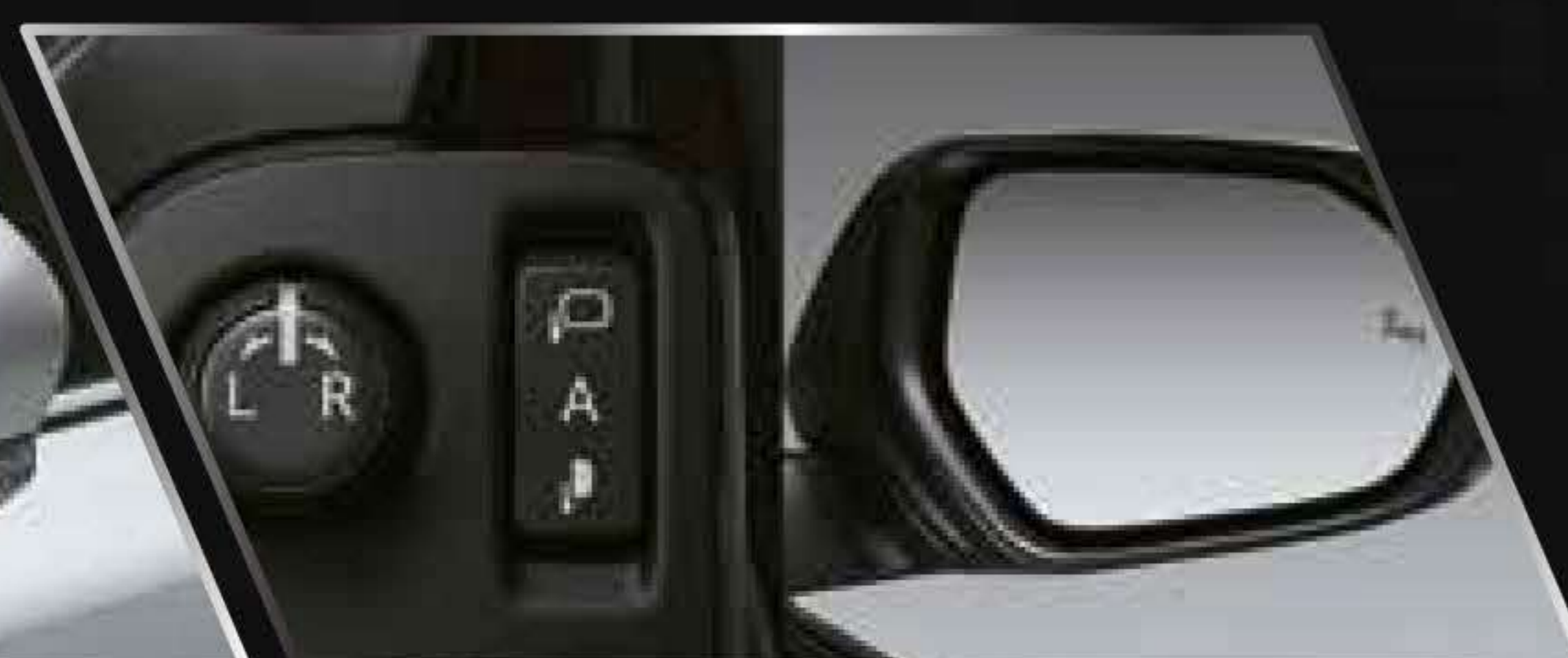
ELECTRICALLY RETRACTABLE OUTER MIRROR