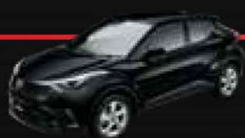
Attitude Black Mica