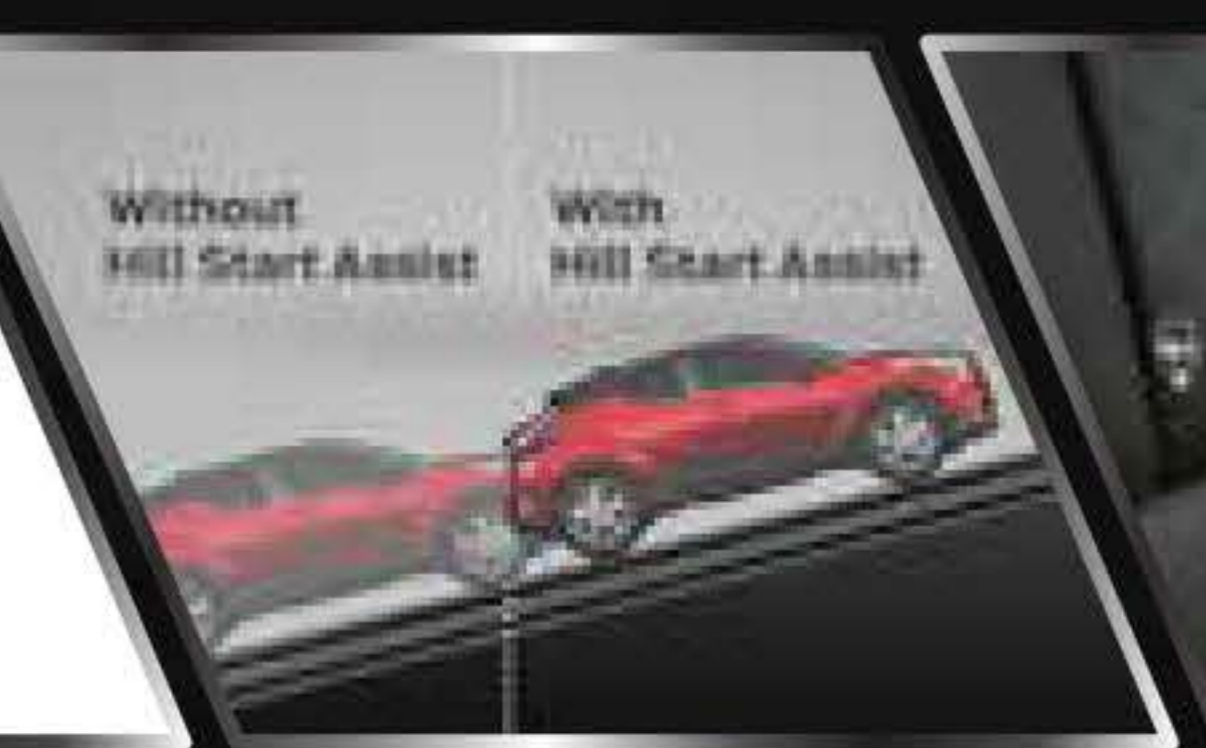
HILL START ASSIST CONTROL