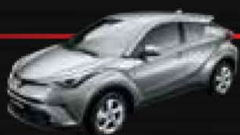
Metal Stream Metallic