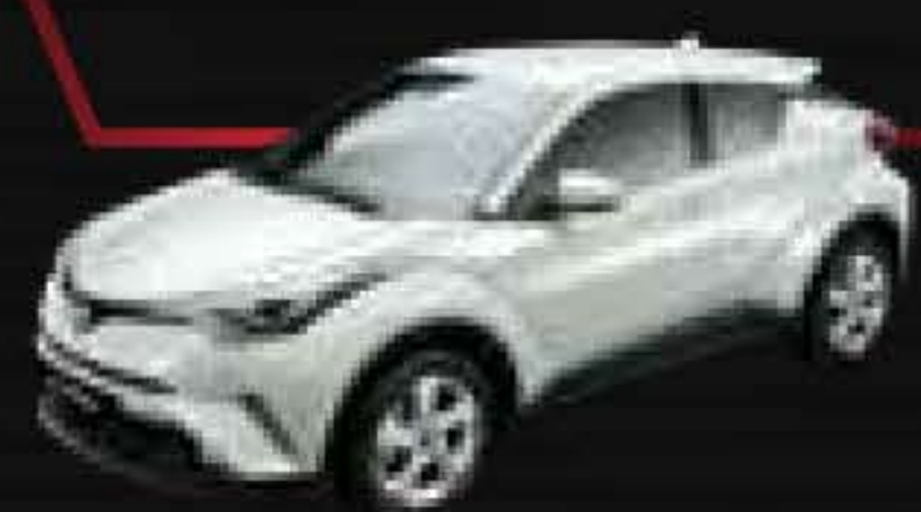
White Pearl Crystal Shine