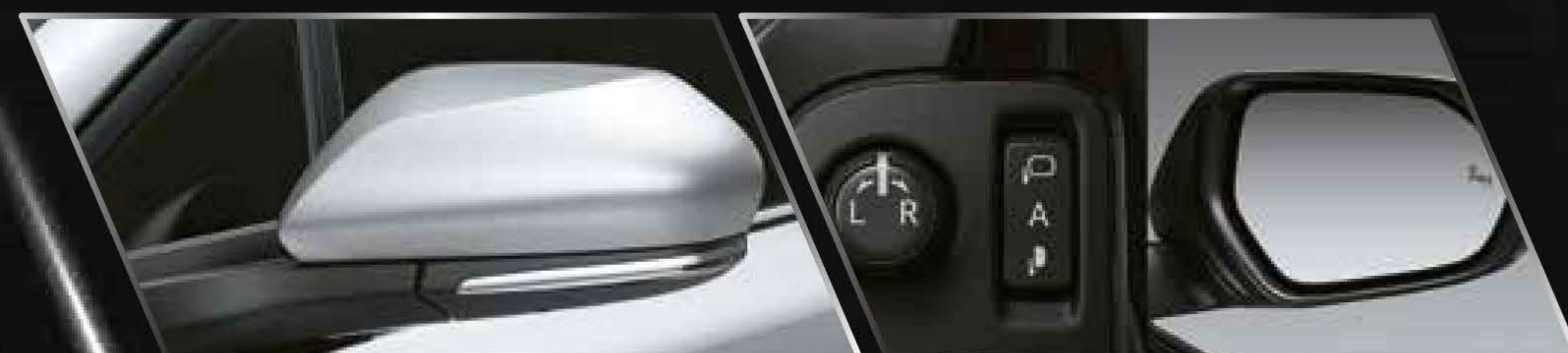
OUTER MIRROR WITH SIDE TURN SIGNAL LAMP