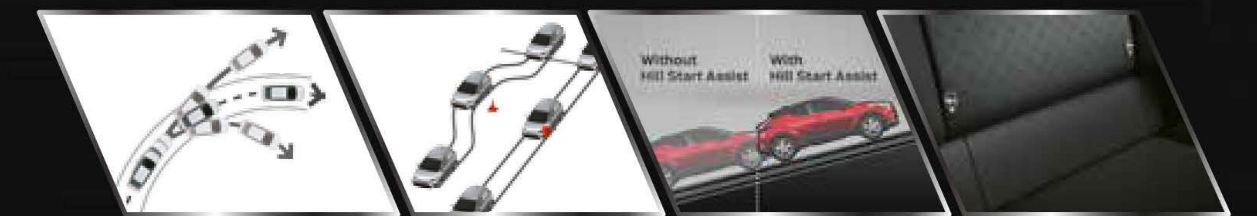
VEHICLE STABILITY CONTROL (VSC)