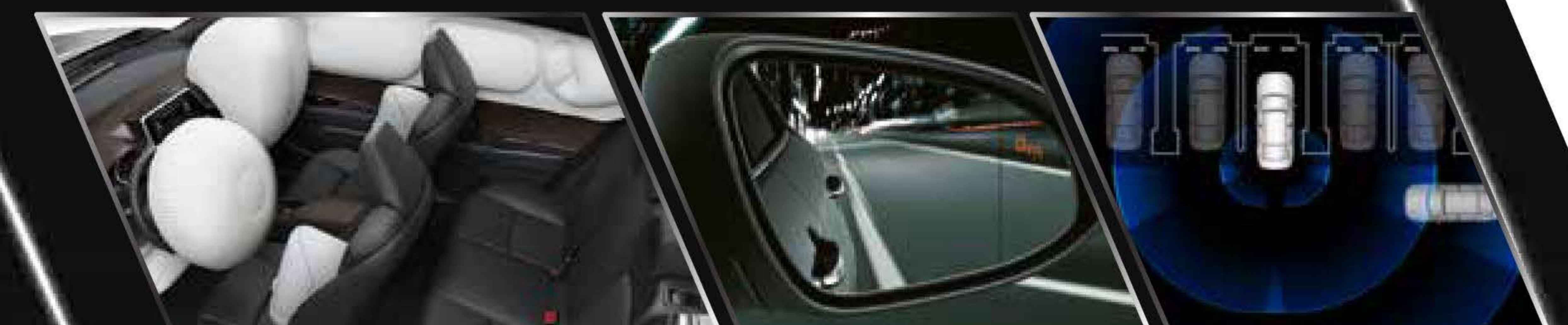
7 SRS AIRBAGS (DRIVER + PASSENGER 2 SIDE AIRBAGS; 2 CURTAIN SIDE AIRBAGS, & DRIVER KNEE)