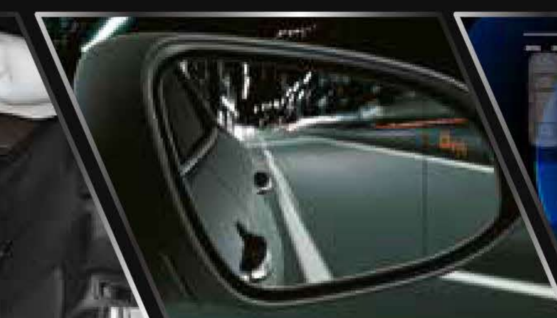
BLIND SPOT MONITOR SYSTEM