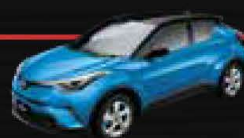
Blue Metallic with Sporty Black Roof