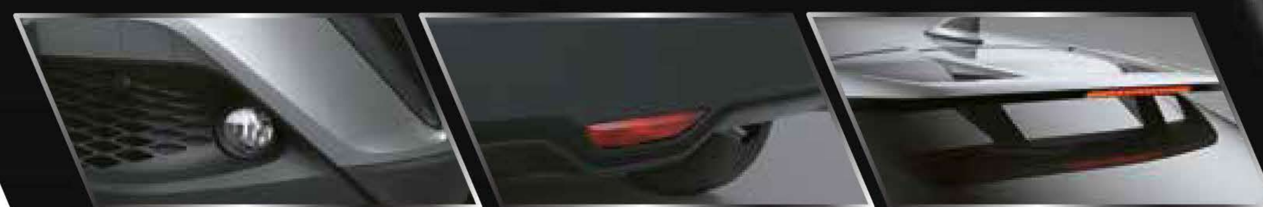
FRONT FOG LAMP & DRIVING LAMP

The new Toyota C-HR carries state-of-the-art safety technology with advance safety features and that are designed to help keep you alert and safe in the event of an accident.